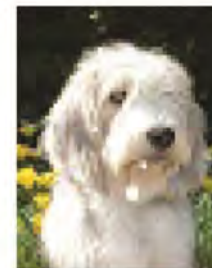
CH. Soletrader Ozzy Osbourne (Ozzy)