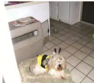
CH. Dehra Fabian (Arthur)