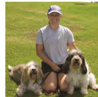
Le Chasse's Wipeout, TDX (Crash) Pictured on right sitting