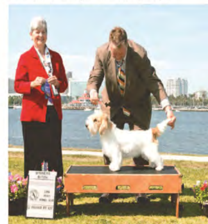
Our newest Member – CH. Gemshorn You Were Made for Me (Roxy)